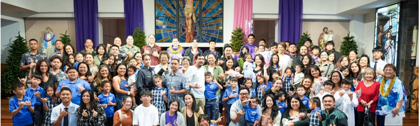
Alumni and their family members at the First Annual Alumni & Family Day

St. Joseph Parish School Alumni Newsletter