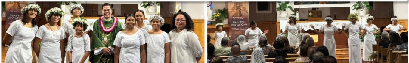
WHITE SUNDAY | OCT. 13 On 'White Sunday,' a Samoan tradition dedicated to the children, was celebrated at the 6am Mass. The Samoan Youth shared scriptures through word, song and dance. Thanks be to God for our youth!