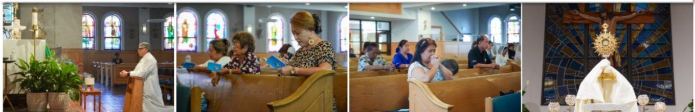
DIOCESAN ROSARY CONGRESS | OCT. 9 St. Joseph participated in the Diocesan Rosary Congress with Eucharistic Adoration from 12pm to 6pm. Various ministries and groups recited the Rosary, led prayers and hymns at each hour as they prayed for peace in our cities, nation, & world.