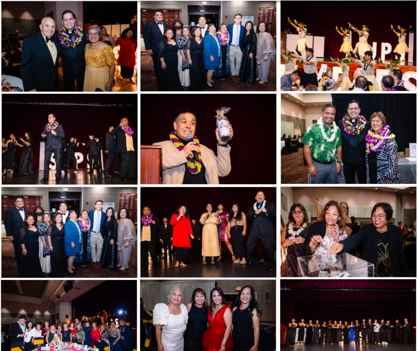
NEW YEAR'S BALL GALA | JAN 31 St. Joseph Parish & School celebrated their first Gala on Friday, January 31 at the Hawaii Okinawa Center in Waipio. It was a wonderful night full of fun, laughter, and unforgettable memories. Join us for the next one on January 30, 2026—Masquerade Ball! See you there